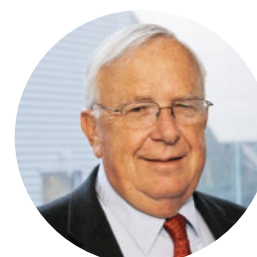
Dr. Michael Merzenich