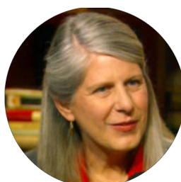
Dr. Jill Bolte Taylor