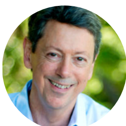
Dr. Rick Hanson